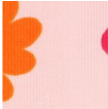
04073.004 LIGHT PINK