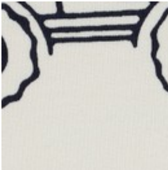
04137.002 OFF WHITE