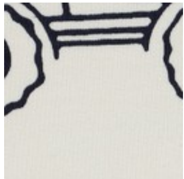
04137.002 OFF WHITE