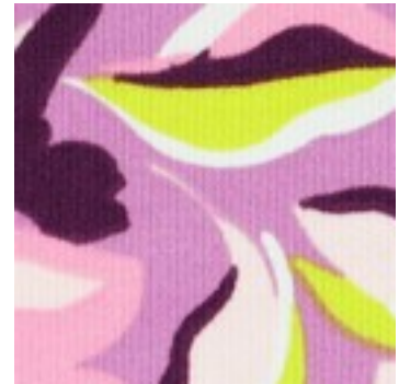
04135.005 PINK / LIME