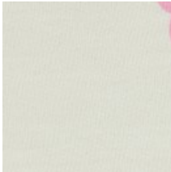
04136.002 OFF WHITE