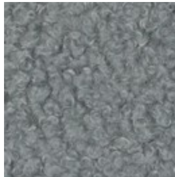
03443.005 PALE TURQUISE