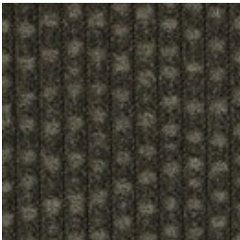
04377.004 ARMY GREEN