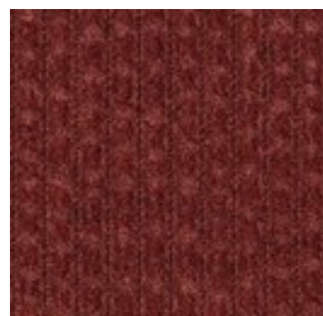
04377.006 DARK ROSE