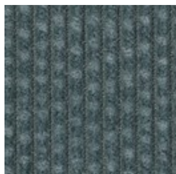
04377.005 OLD GREEN