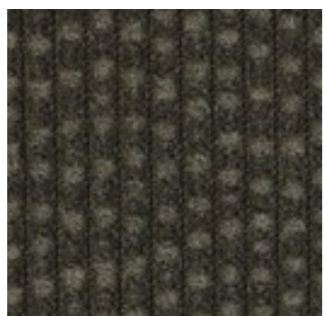
04377.004 ARMY GREEN