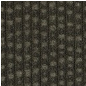
04377.004 ARMY GREEN