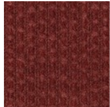
04377.006 DARK ROSE