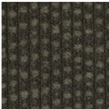
04377.004 ARMY GREEN