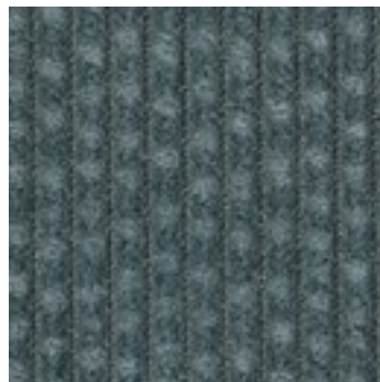
04377.005 OLD GREEN