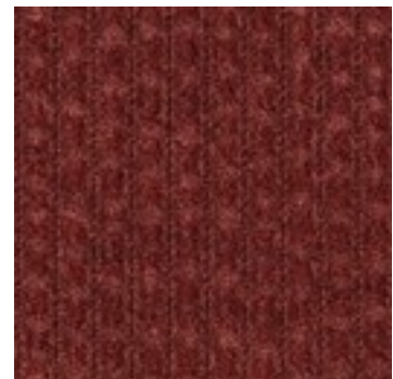
04377.006 DARK ROSE