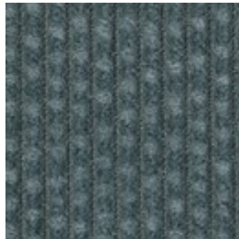
04377.005 OLD GREEN