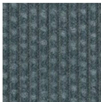
04377.005 OLD GREEN