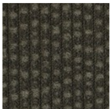
04377.004 ARMY GREEN