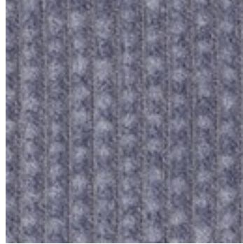
04377.011 DARK LAVENDER