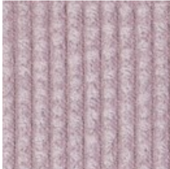
04377.010 OLD PURPLE