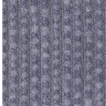
04377.011 DARK LAVENDER