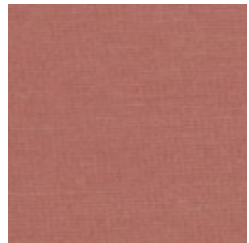
03800.024 OLD ROSE