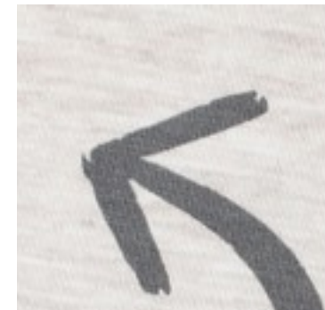
03113.076 BEIGE MELANGE