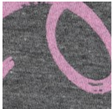
03113.055 GREY MELANGE