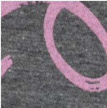
03113.055 GREY MELANGE