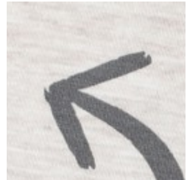
03113.076 BEIGE MELANGE