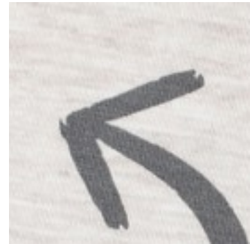
03113.076 BEIGE MELANGE