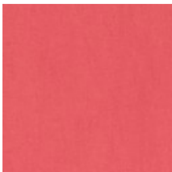
03497.007 BRIGHT CORAL