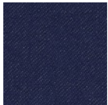
02530.027 DARK COBALT