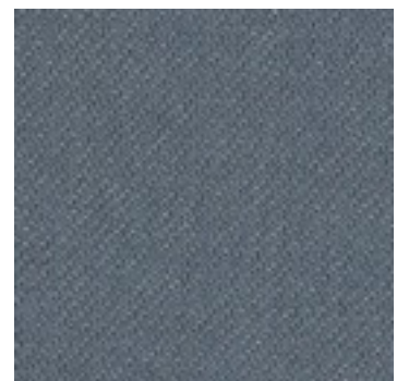
02530.016 BLUE GREY