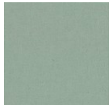
03495.009 OLD GREEN