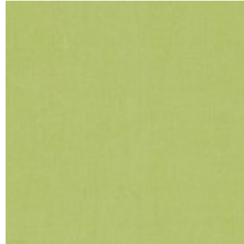
03495.011 OLD LIME