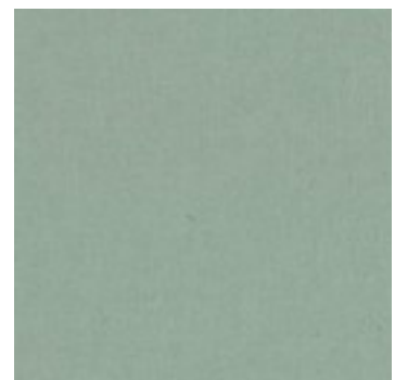
03495.009 OLD GREEN