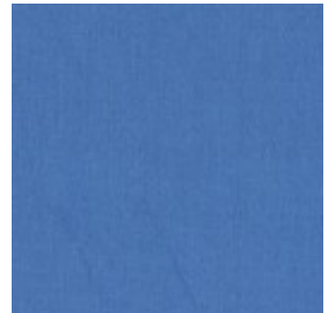
03495.015 ROYAL BLUE