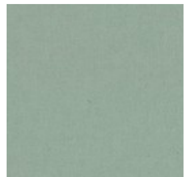
03495.009 OLD GREEN