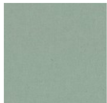
03495.009 OLD GREEN