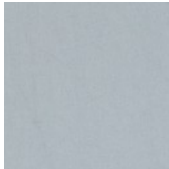
03495.014 PALE TURQOISE