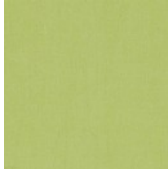
03495.011 OLD LIME