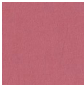
03495.008 DARK BLUSH