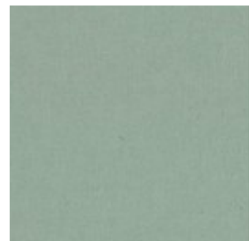
03495.009 OLD GREEN