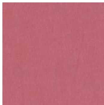
03495.008 DARK BLUSH