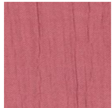
03496.006 DARK BLUSH