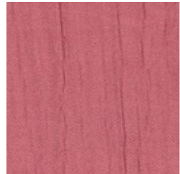
03496.006 DARK BLUSH