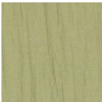
03496.007 OLD LIME