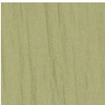
03496.007 OLD LIME