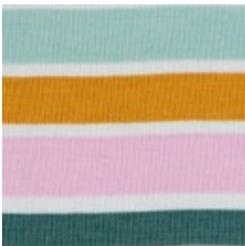
03101.013 MULTI COLOUR