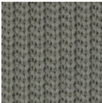
03331.004 OLD GREEN