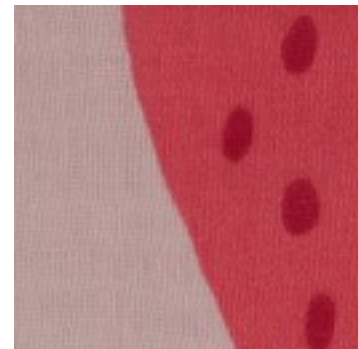
03082.021 LIGHT ROSE