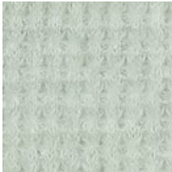
09048.001 LIGHT GREY