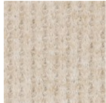
09048.007 LIGHT SAND