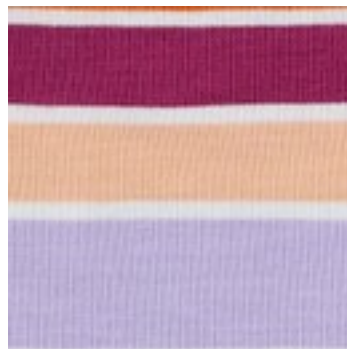
03101.015 MULTI COLOUR