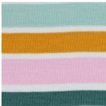
03101.013 MULTI COLOUR