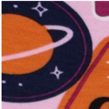
03101.004 LIGHT PINK