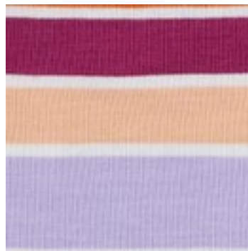
03101.015 MULTI COLOUR