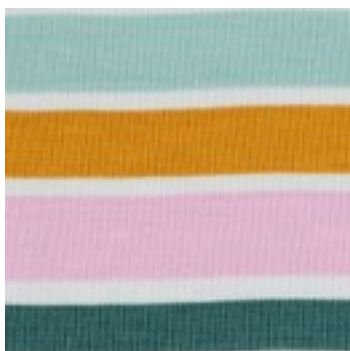
03101.013 MULTI COLOUR