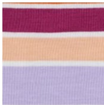
03101.015 MULTI COLOUR