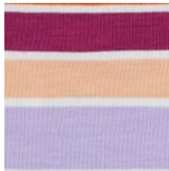
03101.015 MULTI COLOUR