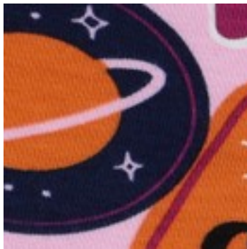
03101.004 LIGHT PINK