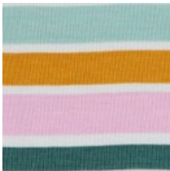
03101.013 MULTI COLOUR