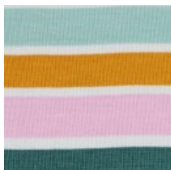
03101.013 MULTI COLOUR