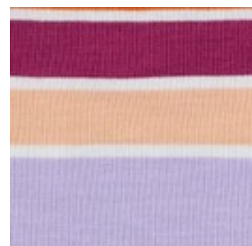
03101.015 MULTI COLOUR