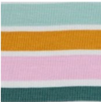
03101.013 MULTI COLOUR