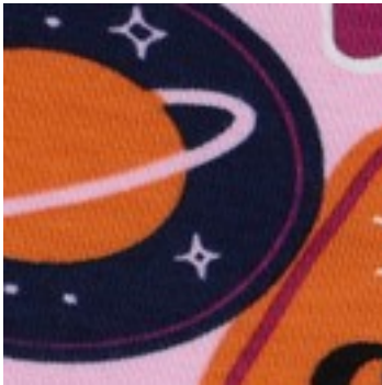
03101.004 LIGHT PINK