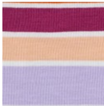
03101.015 MULTI COLOUR