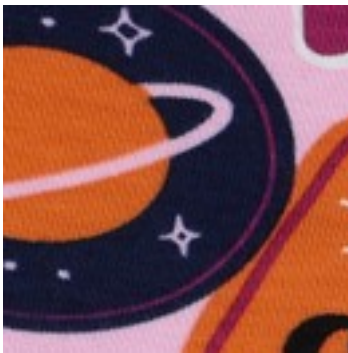
03101.004 LIGHT PINK