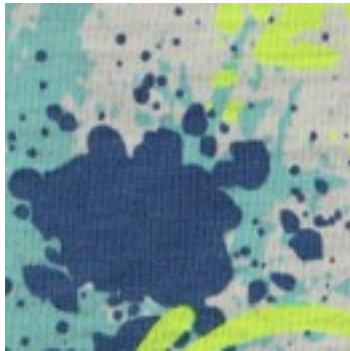
03077.002 ECRU MELANGE