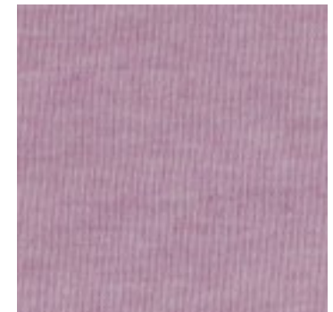
03144.019 LILAC MELANGE