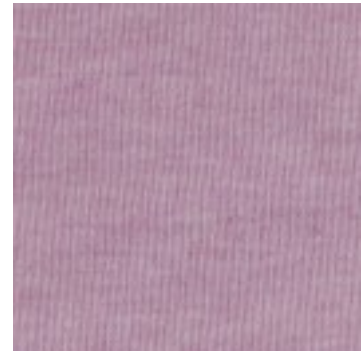
03144.019 LILAC MELANGE