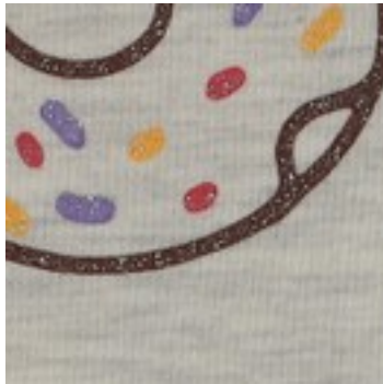
03144.001 ECRU MELANGE