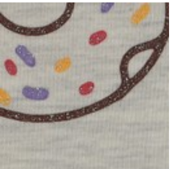
03144.001 ECRU MELANGE