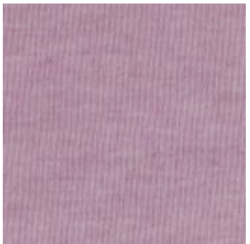
03144.019 LILAC MELANGE