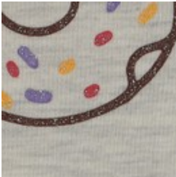
03144.001 ECRU MELANGE