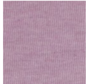
03144.019 LILAC MELANGE