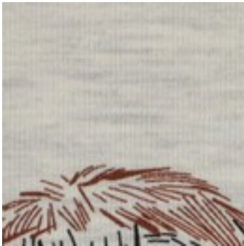
03114.001 ECRU MELANGE