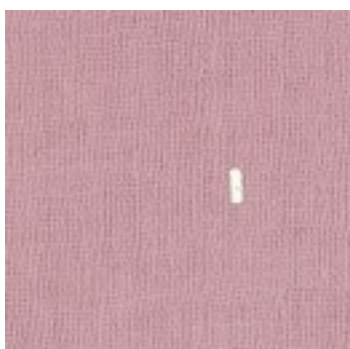
07261.008 OLD ROSE/GOLD