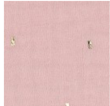
07261.003 LIGHT ROSE/GOLD