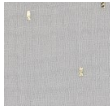
07261.007 LIGHT GREY/GOLD