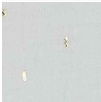
07261.006 OFF WHITE/GOLD