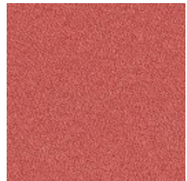
03710.038 DARK BLUSH