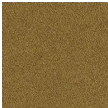
03710.040 MOSS GREEN