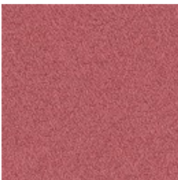
03710.039 ROSE WOOD