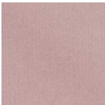
04663.008 DARK POWDER