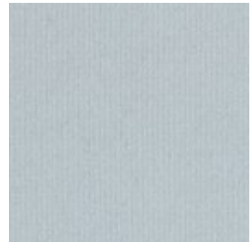
04663.007 PALE TURQOISE