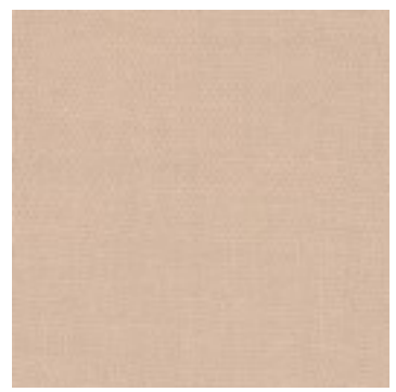
03959.025 LIGHT SALMON