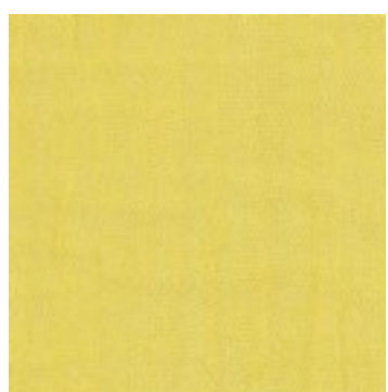
03959.026 SOFT YELLOW