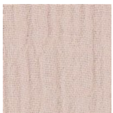
03959.015 SOFT ROSE