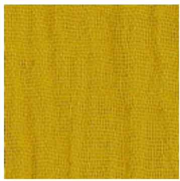
03959.023 DARK YELLOW