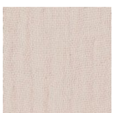
03959.021 LIGHT ROSE