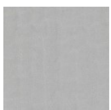
03959.022 LIGHT GREY